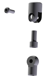
BA 04 VS LOWER FIXING