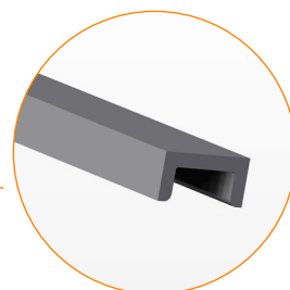
STEEL "U" PROFILE 40x20 mm.