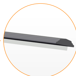
STEEL SHAPED HANDRAIL 50x15 mm.