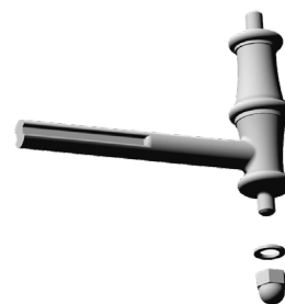
BA 02 LS LATERAL FIXING