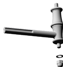
BA 02 LS LATERAL FIXING

COLUMN HEIGHT CAN VARY ACCORDING TO THE SIZE OF THE STEP