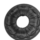
BA 03 LS COVER FOR HOLE ROSETTE